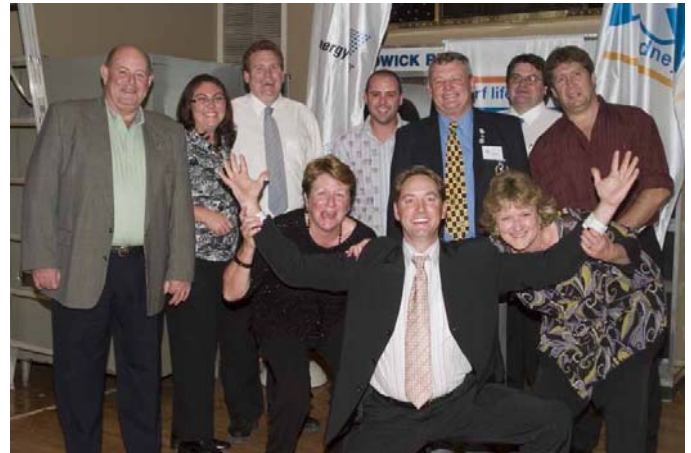
BURNING PALMS ENERGY AUSTRALIA CHAMPION CLUB OF THE YEAR 2006-07